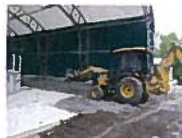
Miigwetch to everyone who volunteers their time and equipment!

down. Ian is looking for two volunteers to assist Sports Systems to install these upgrades. If you are interested in volunteering your time to this important community project, contact Ian Big Canoe at (905) 953-6338.