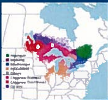
Anishinabek territories prior to 1800's

“A land claim can ...foster economic development by creating shared understandings, disproving misconceptions and creating unique opportunity for business relations”