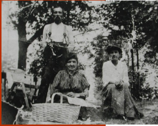
photo of a family making baskets in the early 1900's.

“The First Nation must find ways to create self-sufficiency and participate in the local economy.”