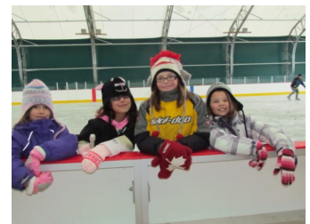
Island youth enjoying a day at the rink in February 2011.

Construction activities will be starting soon. Thanks to Trillium Foundation for their generous support..